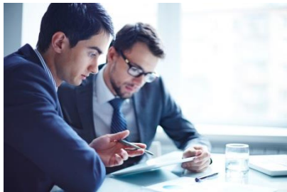
Thorough Due Diligence

B.E.S.T. and our partners vision is simple... We understand the nuances involved with background screening, adapt quickly to each customer's requests, and each states' screening requirements to achieve desired results.